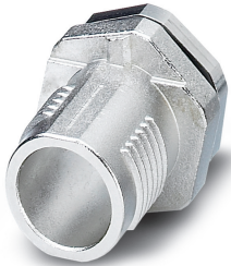
M12 SPEEDCON housing screw connection for M12 male inserts, with O-ring, for all SPEEDCON-capable THR and wave soldering contact carriers

Please be informed that the data shown in this PDF Document is generated from our Online Catalog. Please find the complete data in the user's documentation. Our General Terms of Use for Downloads are valid ( http://phoenixcontact.com/download )